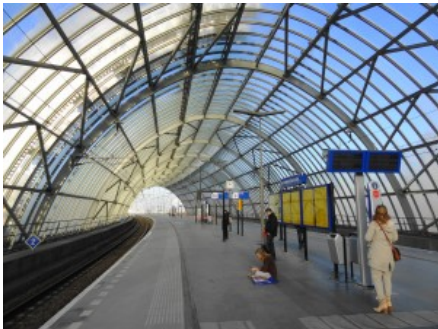
Platforms 9 and 10 at station Sloterdijk

The office is a 4 minute walk from Amsterdam Sloterdijk. See further below for the walking route.